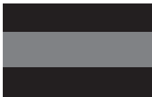
PATTERN 7 (2-color)