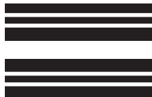
PATTERN 9 (2-color)