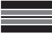
PATTERN 2 (3-color)