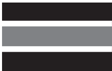
PATTERN 6 (3-color)