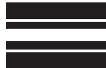
PATTERN N (2-color)

COLOR NUMBERS (W= Wool Color, L= Leather Color, N= Naug Color)