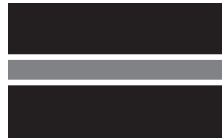
PATTERN 3 (3-color)