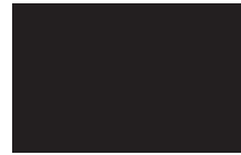
PATTERN 5 (1-color)