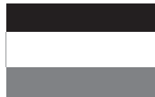
PATTERN 8 (3-color)