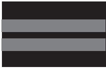
PATTERN 1 (2-color)

Please order knit trim colors in sequence with the color closest to the body first.