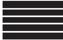
PATTERN 4 (2-color)